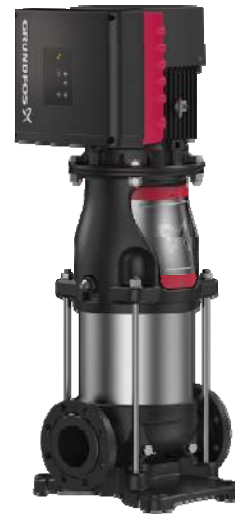
No alignment is required