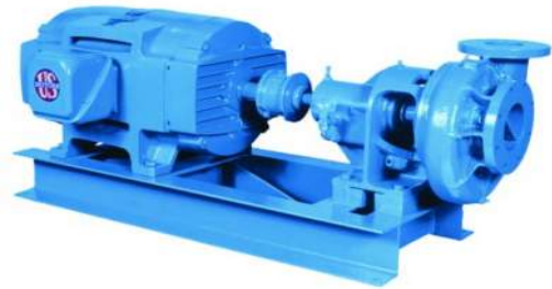
Unbalanced forces and increased vibration